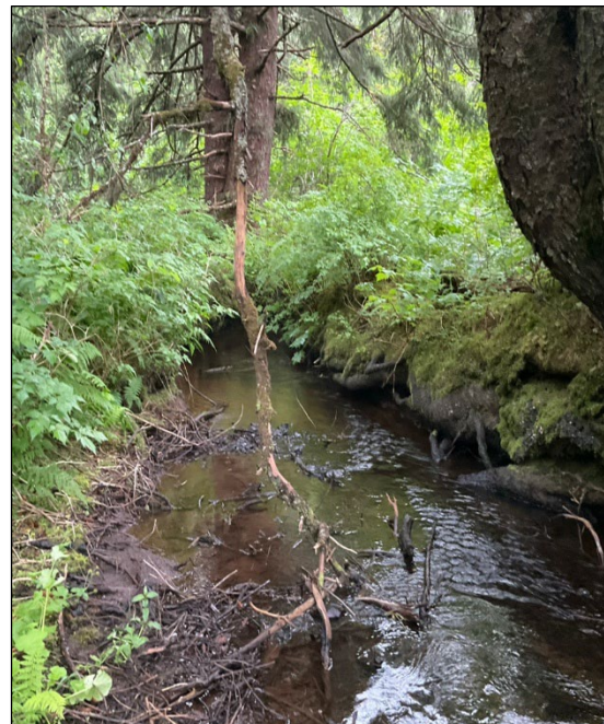
Figure 2.–Looking downstream at waypoint 633.