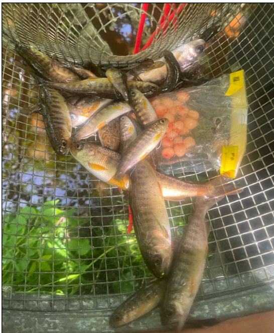
Figure 1.–Juvenile coho salmon caught at waypoint 633.